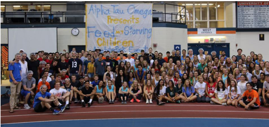
Fall 2017 Feed My Starving Children MobilePack event in U of I Armory

For the third year in a row, Gamma Zeta will be leading a MobilePack event in Champaign for Feed My Starving Children. This year's event will be held September 23rd at the ARC (used to be IMPE). Our chapter will be gathering 500 volunteers to help pack over 100,000 meals for needy, hungry children around the world. All alumni and their families are invited and encouraged to participate either in person or by making a donation. Here's a link for donations, to