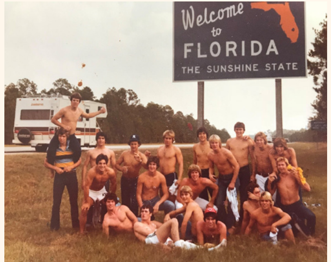
'82s pledge walkout ... haven't changed a bit!