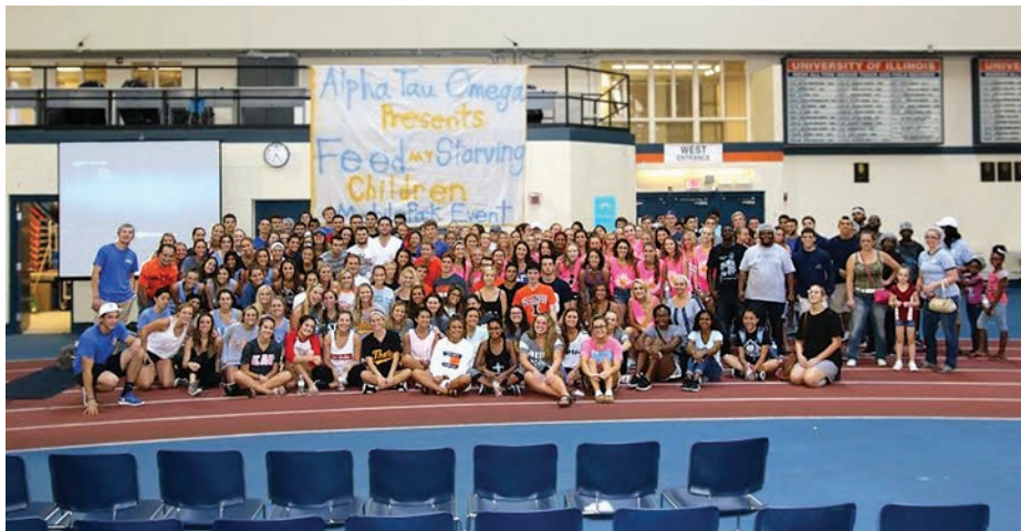
Gamma Zeta Chapter hosts Feed My Starving Children event on September 25 and got a great turnout.

On Sunday, September 25, ATO Gamma Zeta led a giant event in the Armory with Feed My Starving Children to pack food for malnourished children around the world. They raised over $25,000 in the last year at the Dad's Day Casino Night and Mom's Day Silent Auction with great support through donations from Gamma Zeta Alumni. They also recruited nearly 500 people, including representatives from the Pikes, Alpha Phi Alpha, DGs, Thetas, TriDeltas, and many more to work shifts packing food. The result was over 108,000 meals packed in one day. That's enough to feed over 170 children every meal every day for a year. There was a very