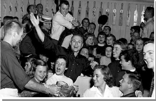
ATO's at Bidwells in 1956

Homecoming will be held on Saturday, October 7 , with Illinois taking on Indiana. Kickoff time is yet to be announced, but plan on stopping by the house for a catered party and socializing with fellow Gamma Zetas. Other post-game activities will include awarding the undergraduate scholarship winners, a special alumni room renovation dedication, and live entertainment.