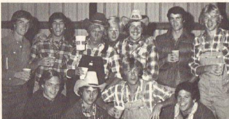
An ATO contingent at a recent sorority barn dance.

Taus still find time to plan a heavy social calendar no matter how busy we are. Exchanges (parties with specific sororities) convene up to six times a semester. Our best remembered exchange was with the Illini cheerleaders and pompon girls. The annual party with the Ice Capettes, girls who skate with the Ice Capades, is a close second. Our three main events of the year are as follows: Pledge Dance is a costume party planned and hosted by the pledges. Outhouse Scramble, a lavish picnic, signifies the beginning of Spring. The ATO Sweetheart Formal follows shortly after Outhouse. Our Sweetheart, the girl voted most popular by Taus, is announced and crowned during the dance. Past locations for Sweetheart have been The Chicago Hyatt House, a riverboat in St. Louis, and the O'Hare Hyatt House. For a closer look at ATO social life, visit us during Formal Rush.