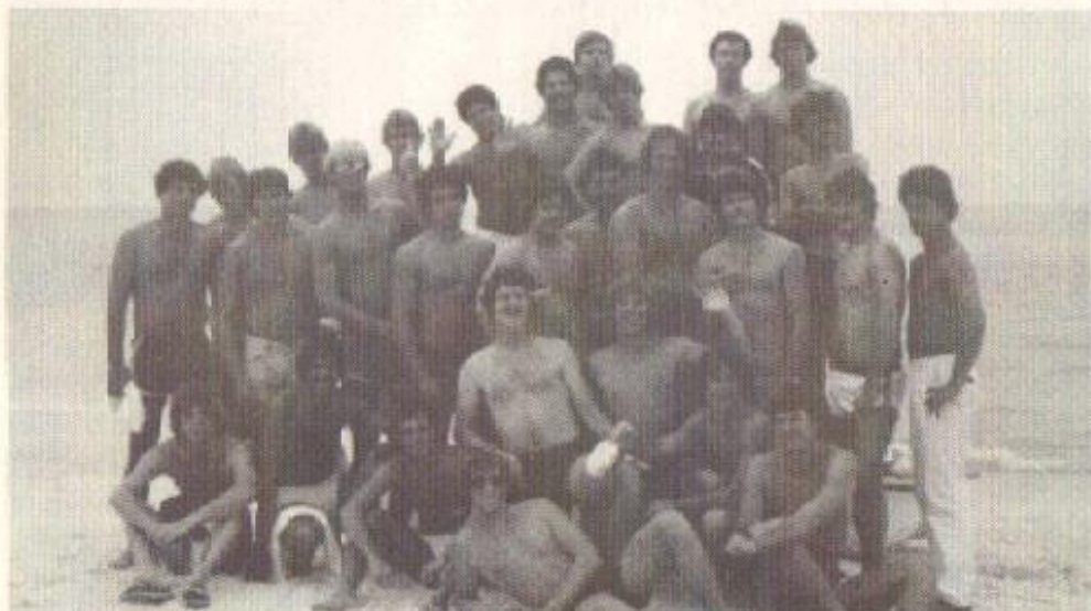
Taus in Florida during the annual spring break migration.

Since our chapter at U of I is almost 100 years old, Tau alums number well over 1000. The Homecoming celebration each year draws many alumni and their families back to their alma mater. The alums take a vital interest in helping us keep ATO on top.