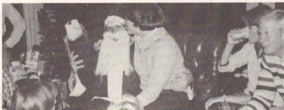
ATO Little Sisters with Santa Claus

Our Little Sisters actively participate in most house functions. ATO's largest philanthropy, the Car Wash for the American Cancer Society, is co-sponsored by our Little Sisters. As many as six parties a semester are solely for ATO's and these girls. You can meet our Little Sisters by visiting ATO during formal rush.