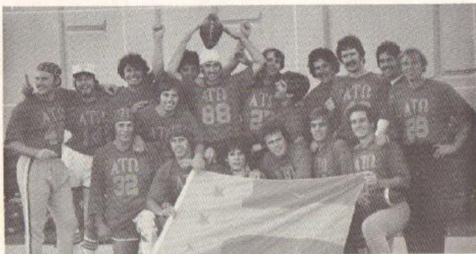
All University Championship Football Team

Only high quality individuals and exceptional athletes can maintain our rich athletic tradition. Our high level teams coupled with the character of our athletes leaves ATO the only fraternity for the prospective campus athlete. Your decision to join the men of ATO will enhance the class of our athletic program.