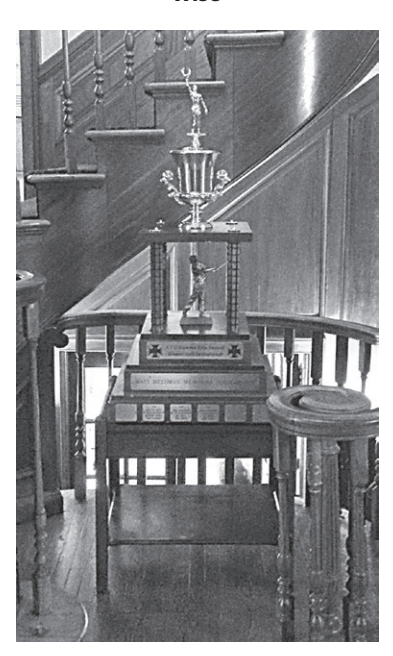
Restored Heldman Trophy