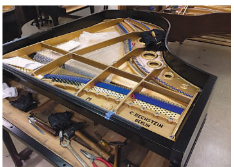
Our piano with its new sound board, restored frame and case and new "Bechstein Blue" felt

I visited The Piano People in Champaign on September 21, 2014, to check up on the status of our historic Bechstein grand piano's