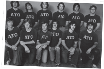
ATO's are dominating in athletics on campus. Read more on page 4.